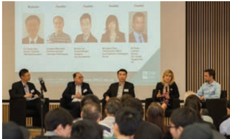
SIM GE Industry Forum