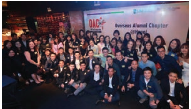
Overseas Alumni Chapter