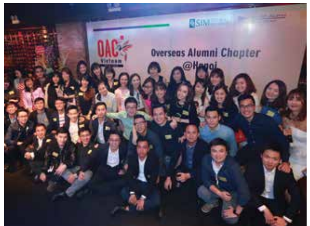
Overseas Alumni Chapter