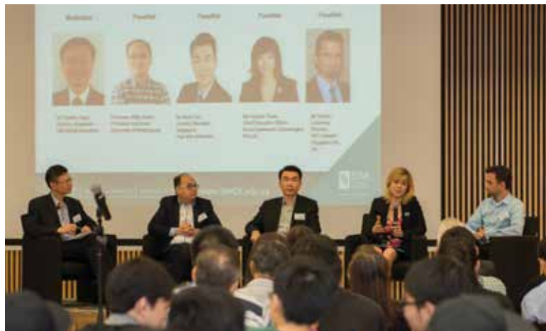
SIM GE Industry Forum