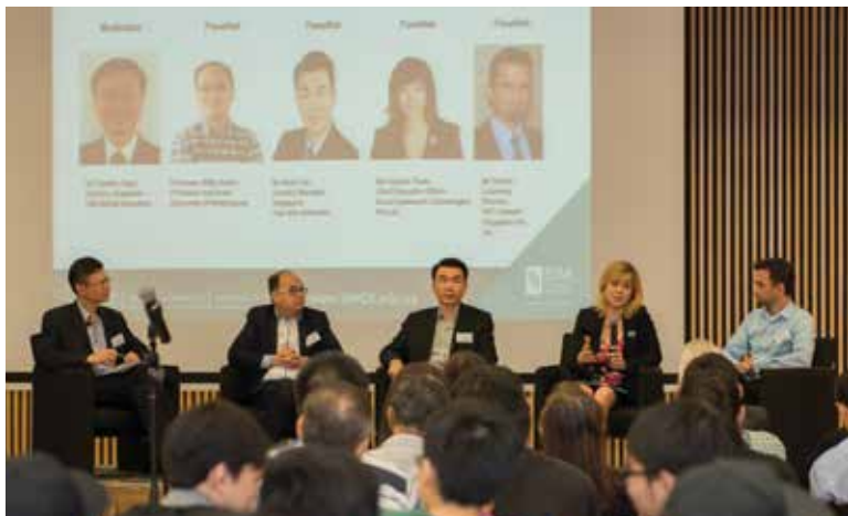
SIM GE Industry Forum