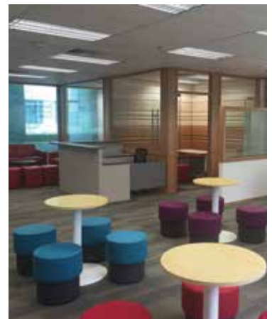
Student Learning Centre