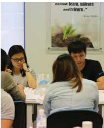
Peer-Assisted Learning (PAL) in session

Work with our advisors to improve your skills in written and oral presentation.