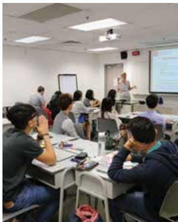
Digital Literacy Workshop