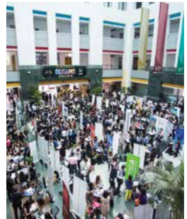
Career fair offering internships and jobs