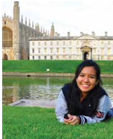
Global exposure and learning opportunities