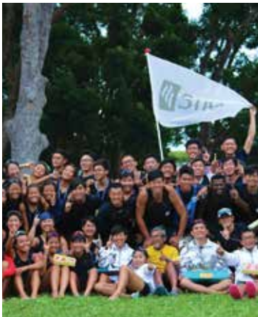
Grooming achievers outside the classroom

Boost your well-being in healthy living and wellness programmes, or learn more from peer mentors at our dedicated Student Wellness Centre.