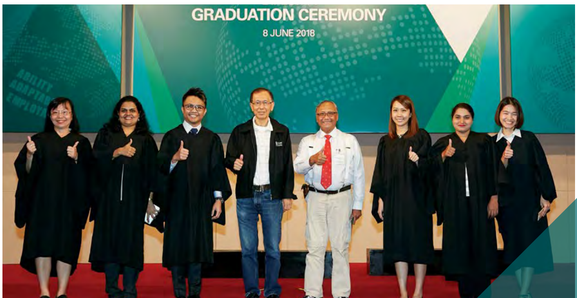
Some of the SIM graduates from the 2018 cohort

Singaporeans with at least two years of HR work experience are eligible to apply. For the monetary award refer to www.skillsfuture.sg/studyawards/human-resource for more information.