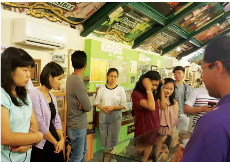
A class field trip to the Singapore Scout Association to learn more about HRM practices, the challenges and approaches in a voluntary welfare organisation.

Refer to www.skillsfuture.sg/credit or www.skillsfuture.sg/studyawards/human-resource for more information.