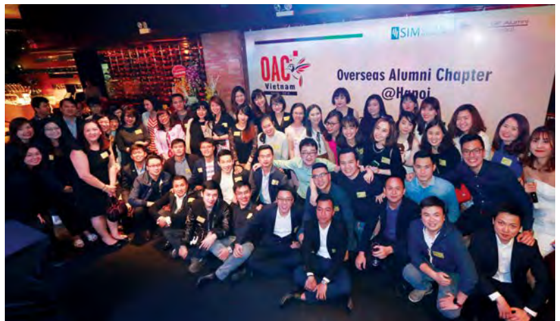
Overseas Alumni Chapter