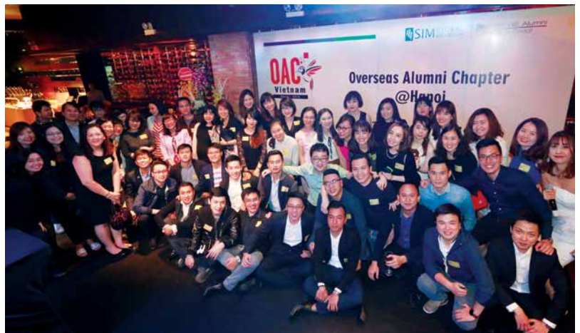
Overseas Alumni Chapter