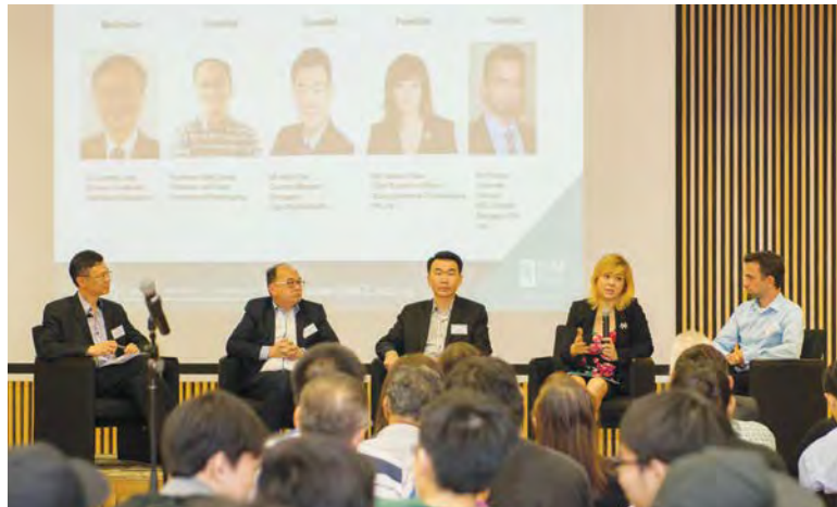
SIM GE Industry Forum