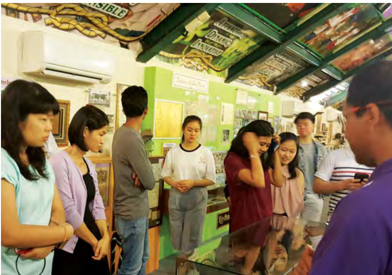
A class field trip to the Singapore Scout Association to learn more about HRM practices, the challenges and approaches in a voluntary welfare organisation.

Refer to www.skillsfuture.sg/credit or www.skillsfuture.sg/studyawards/human-resource for more information.