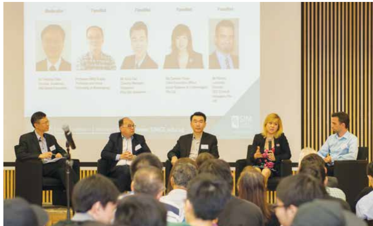
SIM GE Industry Forum