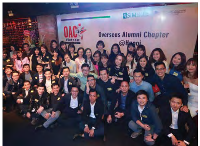
Overseas Alumni Chapter