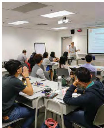
Digital Literacy Workshop