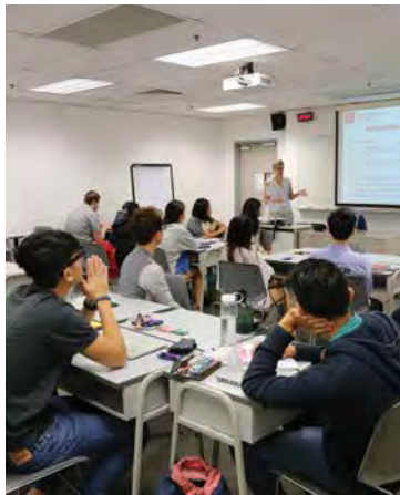
Digital Literacy Workshop