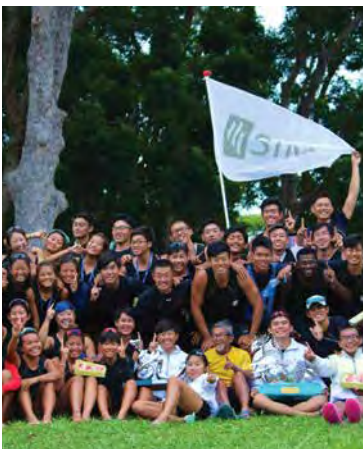
Grooming achievers outside the classroom

Boost your well-being in healthy living and wellness programmes, or learn more from peer mentors at our dedicated Student Wellness Centre.