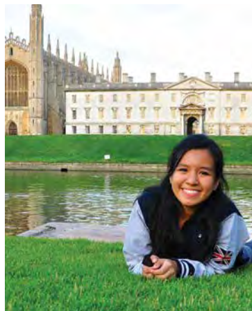
Global exposure and learning opportunities