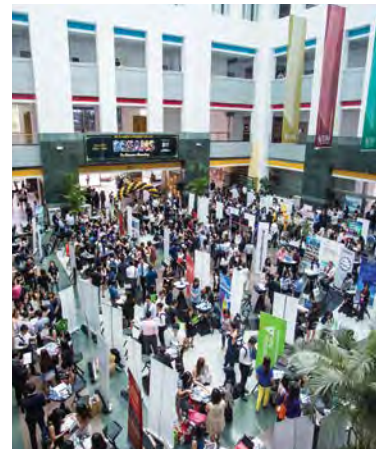
Career fair offering internships and jobs