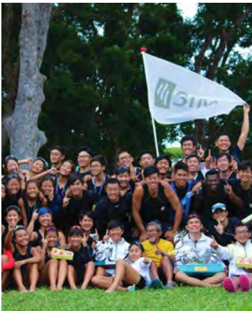
Grooming achievers outside the classroom

Boost your well-being in healthy living and wellness programmes, or learn more from peer mentors at our dedicated Student Wellness Centre.