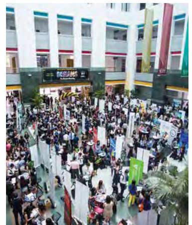
Career fair offering internships and jobs