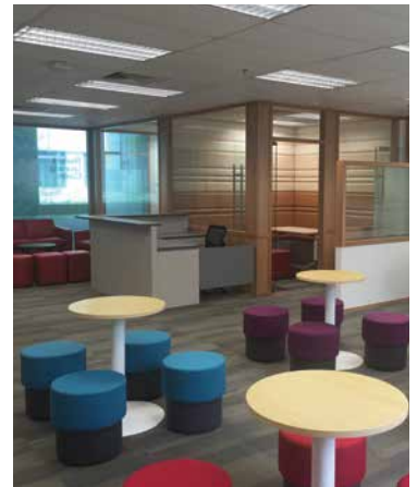
Student Learning Centre