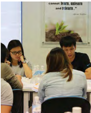
Peer-Assisted Learning (PAL) in session

Work with our advisors to improve your skills in written and oral presentation.