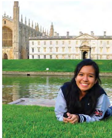
Global exposure and learning opportunities