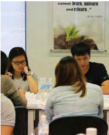
Peer-Assisted Learning (PAL) in session

Work with our advisors to improve your skills in written and oral presentation.