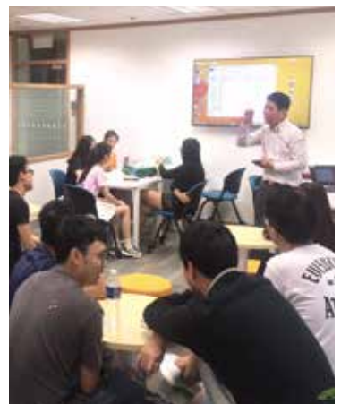
The Talking Point Programme