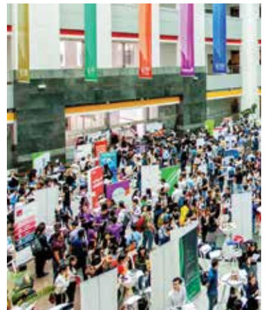
Career fair offering internships and jobs