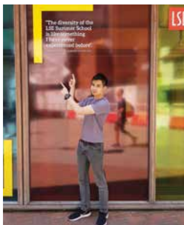
Global exposure and learning opportunities