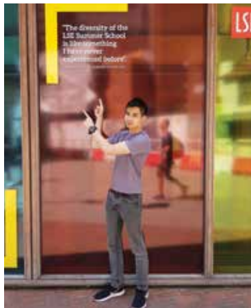
Global exposure and learning opportunities