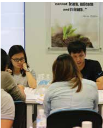
Peer-Assisted Learning (PAL) in session

Work with our advisors to improve your skills in written and oral presentation.