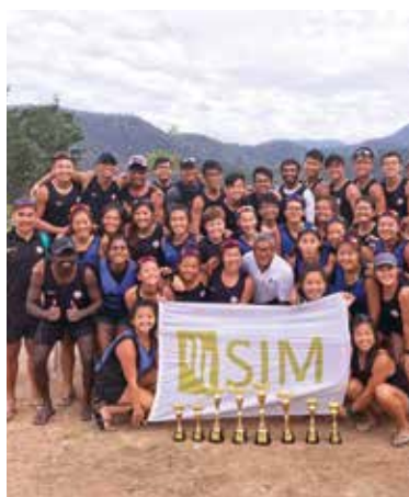
Grooming achievers outside the classroom

Boost your overall well-being through healthy living and wellness programmes, or learn more from peer mentors at our dedicated Student Wellness Centre.