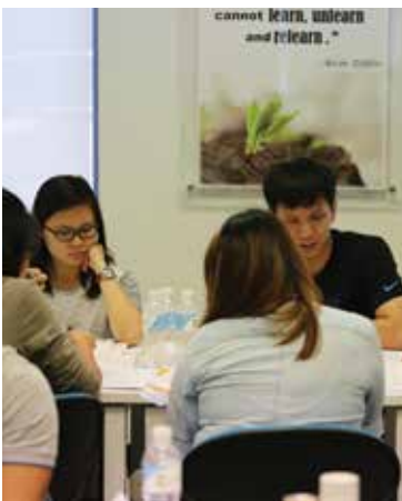
Peer-Assisted Learning (PAL) in session

Work with our advisors to improve your skills in written and oral presentation.