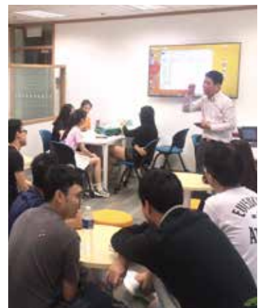
The Talking Point Programme