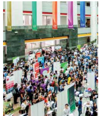
Career fair offering internships and jobs