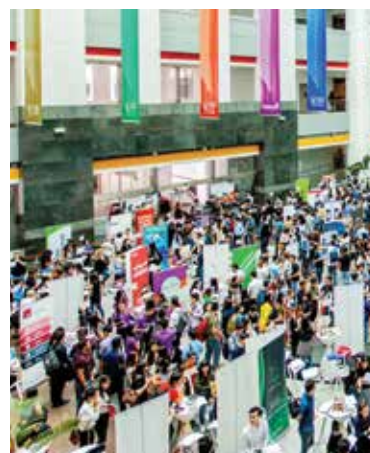
Career fair offering internships and jobs