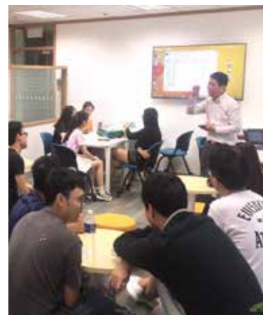
The Talking Point Programme