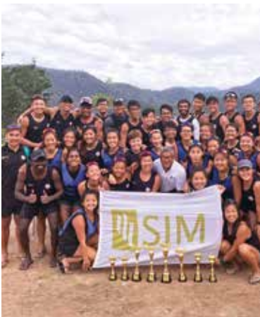
Grooming achievers outside the classroom

Boost your overall well-being through healthy living and wellness programmes, or learn more from peer mentors at our dedicated Student Wellness Centre.